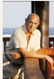
OSCAR DE LA RENTA

“EVERY MORNING I GO OUT ON THE BALCONY, LOOK OVER THE SHIMMERING SEA AND SAY, GOD, THANK YOU.”